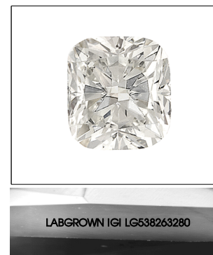
LASERSCRIBE SM Sample Image Used